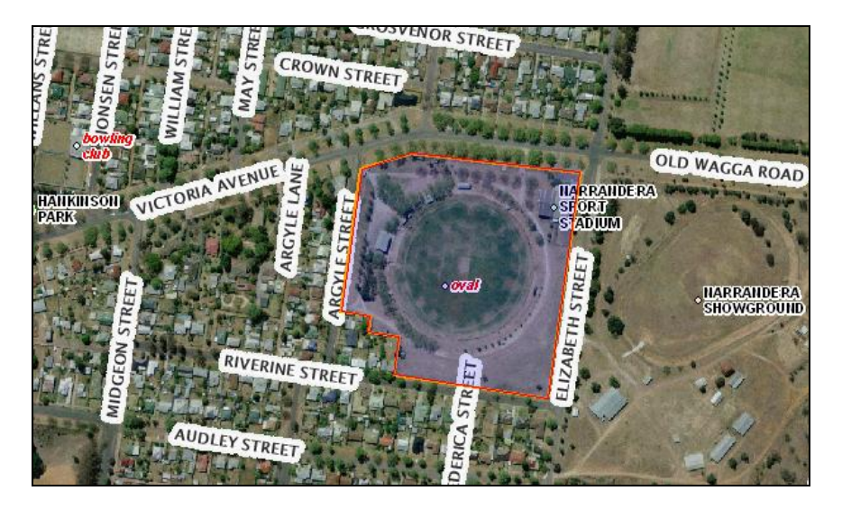
Figure 2: Narrandera Sportsground within the context of its surrounds

Several advertising signs are located around the Sportsground, which are managed by the Committee.