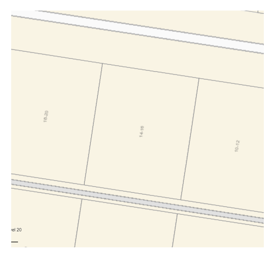
EXISTING: 1 lot approx. 40m x 50m approx. 2000sqm