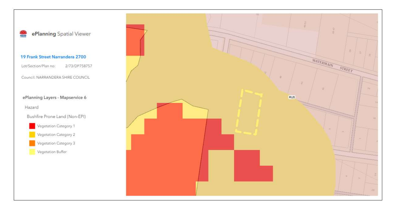
Image 3: Bush Fire Prone Land Map, NSW Planning Portal, obtained April 2023

We believe that this proposal would be permissible.