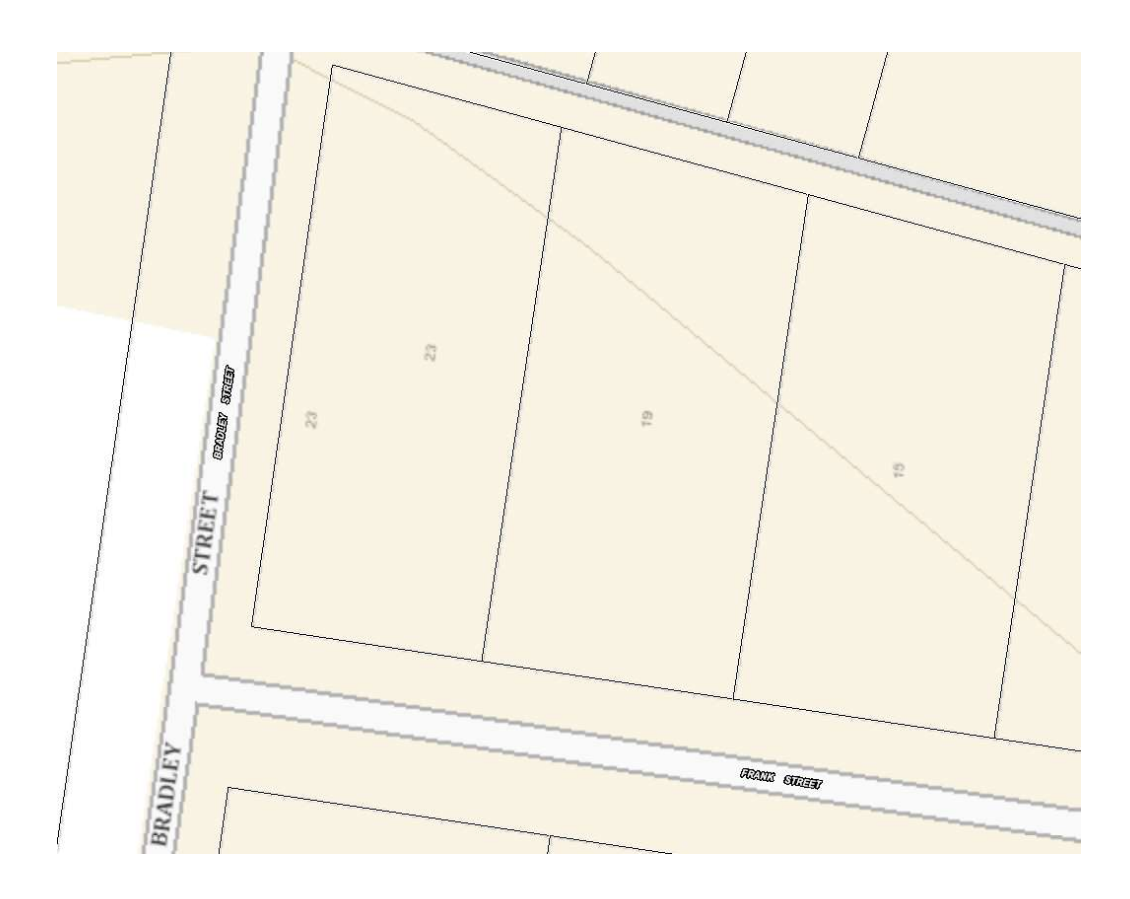
Image 2: Topographical Map of the Subject Land and Surrounds, NSW SIX Maps, obtained October 2022

Type of Development: The development is a subdivision of Lot 2 Section 73 DP 758757 to create 2 lots, being proposed lot 99 of approximately 1,029m<sup>2</sup> and proposed lot 100 of approximately 1,000m<sup>2</sup>.