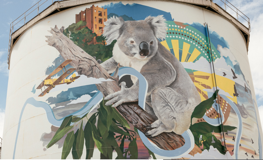
Image - Narrandera Water Tower Artwork, winner of the 2019 Mega Mural Award, Australia Street Art Awards.